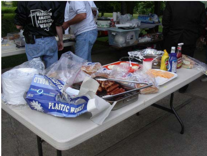
Hams do not live by CW contacts alone !!!