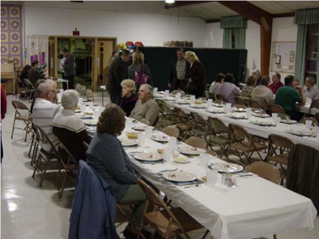
The Banquet room beging to fill up. This year the club filled nearly every seat in the Banquet room!