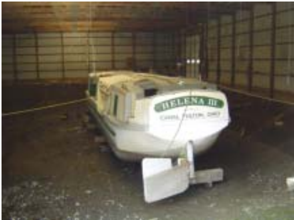
A familiar site during the summer months, the Canal Boat St. Helens III shown here in "Dry Dock".