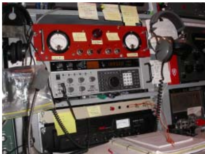
Pictured above is the Ten Tech with various antenna matcher, and switches for testing SWR, etc.