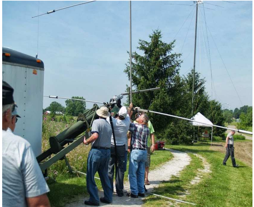
ABOVE : Setting up the E-Com Trailers antennas