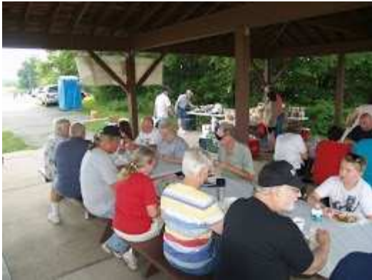
ABOVE: Best time of Field Day— The Evening meal !