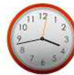
New York United States

We will once again be on Eastern STANDARD time. Now we "FALL" back one hour.