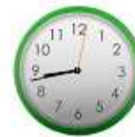
London United Kingdom