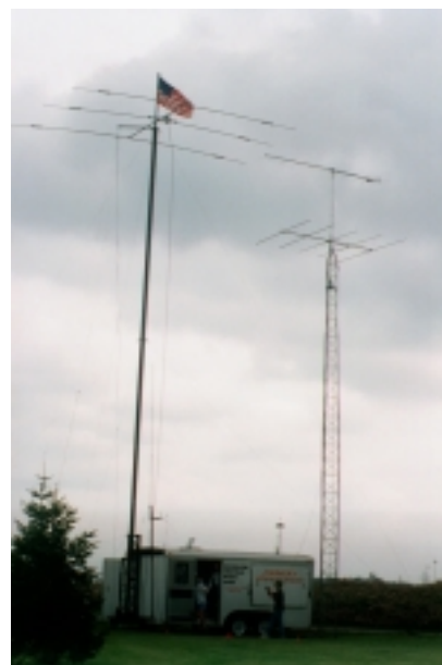
Field Day 2000 MARC E-Com trailer extended to it's full glory !