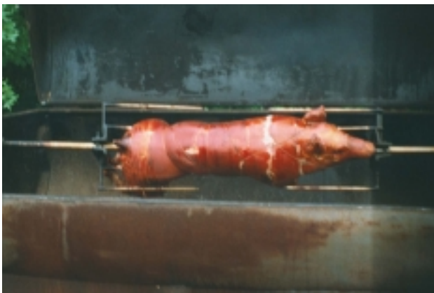
MMMM..... MMMMM Nearly done! "Ole No Code Porkey" sure looks good !